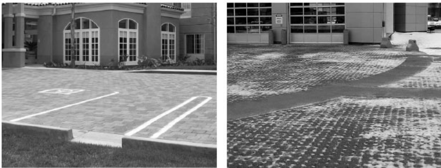
Figure 2. Examples of permeable interlocking concrete pavements for earning LEED® points. The photo on the left shows a hotel entrance in southern California. The photo on the right shows the driveway and parking lot for a fire station in Toronto.

An in-depth presentation of design, specification, construction and maintenance is found in the ICPI publication, Permeable Interlocking Concrete Pavements (ICPI 2000). Most PICP will infiltrate runoff falling directly on it from 80% to 90% of all storms. The infiltration rate of the soil, base thickness (reservoir capacity) and any runoff from contributing areas will determine if PICP qualifies for reducing the peak discharge to the pre-development one and two year, 24 hour peak discharge rate. In most cases PICP will meet this requirement. Pavement infiltration rates are a function of several factors including permeability of the fill material for the surface openings and for the base materials. No. 8 stone typically used in the openings has an infiltration rate exceeding 500 in./hr (12.7 m/hr). Infiltration rates of Nos. 57 and 2 stone used for the base and sub-base exceed 1,000 in./hr (25 m/hr). Over time, the voids in these materials can become clogged, especially around the stone in the surface openings. Nearby sources of sediment can typically run onto the pavement. Periodic maintenance with vacuum sweeping will help maintain high surface infiltration rates. Research has shown that high infiltration rates can be maintained by removing the sediment in the first inch (25 mm) of the openings (Gerrits 2002).