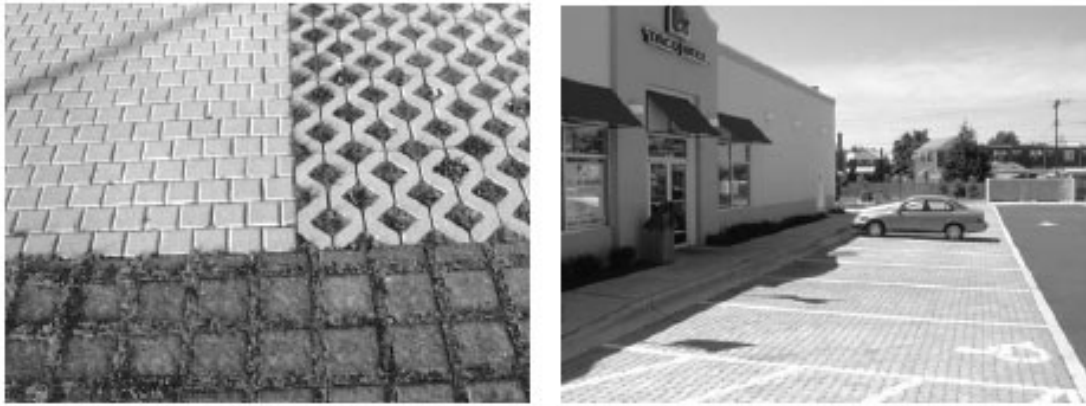
Figure 1. Sustainability for buildings extends to the site with sustainable paving that promotes infiltration and reflects sunlight.