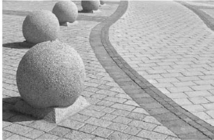
Figure 4. Light colored paving units reflect light and help reduce micro-climatic temperatures.

regularly. Grids and grass will provide heat reducing benefits for these areas. Areas with regular parking should be paved with PICP.