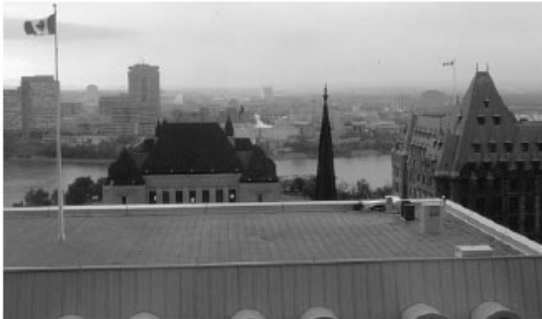
Figure 5. Light colored paving on low-slope roofs reflects light saving on air-conditioning costs while protecting the waterproofing.